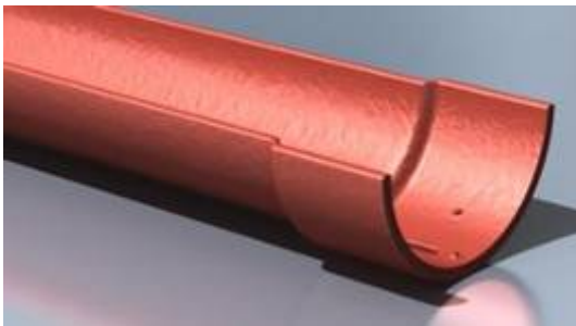
Half Round 113mm (4.5"), 125mm (5"), 152mm (6")

Authentic sand castings combine traditional manufacture with modern quality control and standards to create a high quality range of traditional cast iron gutters. Apex Heritage gutters have simple socket or spigot, wet sealed and bolted joints and are available factory primed or pre-painted.