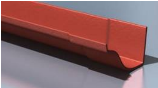
Victorian Ogee 113mm (4.5"), 125mm (5")