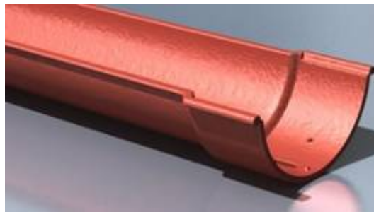
Beaded Half Round 113mm (4.5"), 125mm (5")