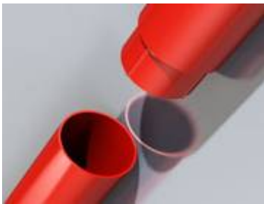
Circular 63, 76, 102, 152 mm dia

A contemporary range of extruded aluminium downpipes. The Flushjoint system is based on concealed spigots which give a smooth, clean appearance that complements modern building design. The pipes are mounted on brackets to stand clear of the structure.