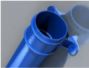
Circular 63, 76, 102, 150mm dia

A range of traditionally designed, socketed aluminium downpipes. Connections between pipes and fittings are made with loose cast sockets, available with ears for fixing back to the wall. Pipes can also be fixed with a choice of base clips to give alternative projections.