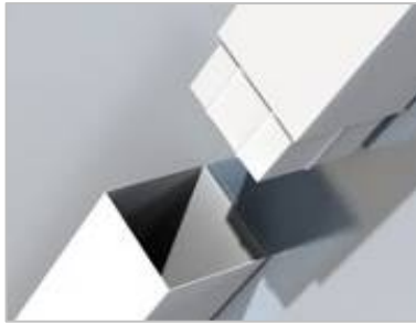
Square 75x75, 100x100mm