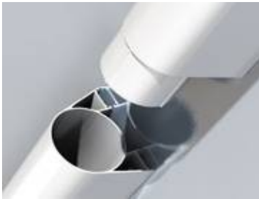
Circular 86x106, 111x138mm

A contemporary range of extruded aluminium downpipes designed for mounting flush with the building fabric. Guardian pipework has concealed brackets and concealed jointing which provides a high level of security.