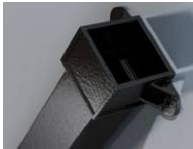
Square 75x75, 100x100mm